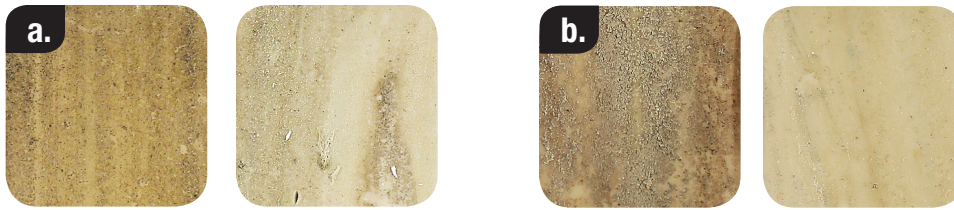
Figure 3. Simulated contamination of evacuation lines before and after treatment.

a) Monarch before b) Monarch after c) Purevac before d) Purevac after